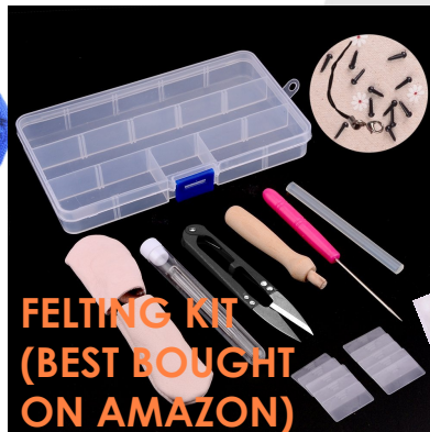
FELTING KIT (BEST BOUGHT ON AMAZON)